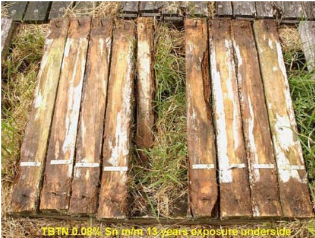
Figure 3. TBTN-treated P. radiata decking with 0.08% m/m tin after 13 years, underside.