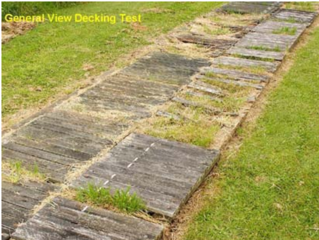
Figure 2. Example of decking test near Rotorua

In practical terms, a rating of 6 or less means the sample, if it had been part of an actual deck, would be unserviceable. Results indicate that TBTO is more effective than TBTN, although there is a more pronounced dosage response with the latter. Figure 3 shows several failed TBTN-treated deck specimens which contained 0.08% m/m tin. Copper naphthenate is superior to both at currently approved retentions (Fig. 4). This trial is one of the more relevant available for assessing the performance of TBTN in decking. Copper naphthenate is a useful comparative preservative.