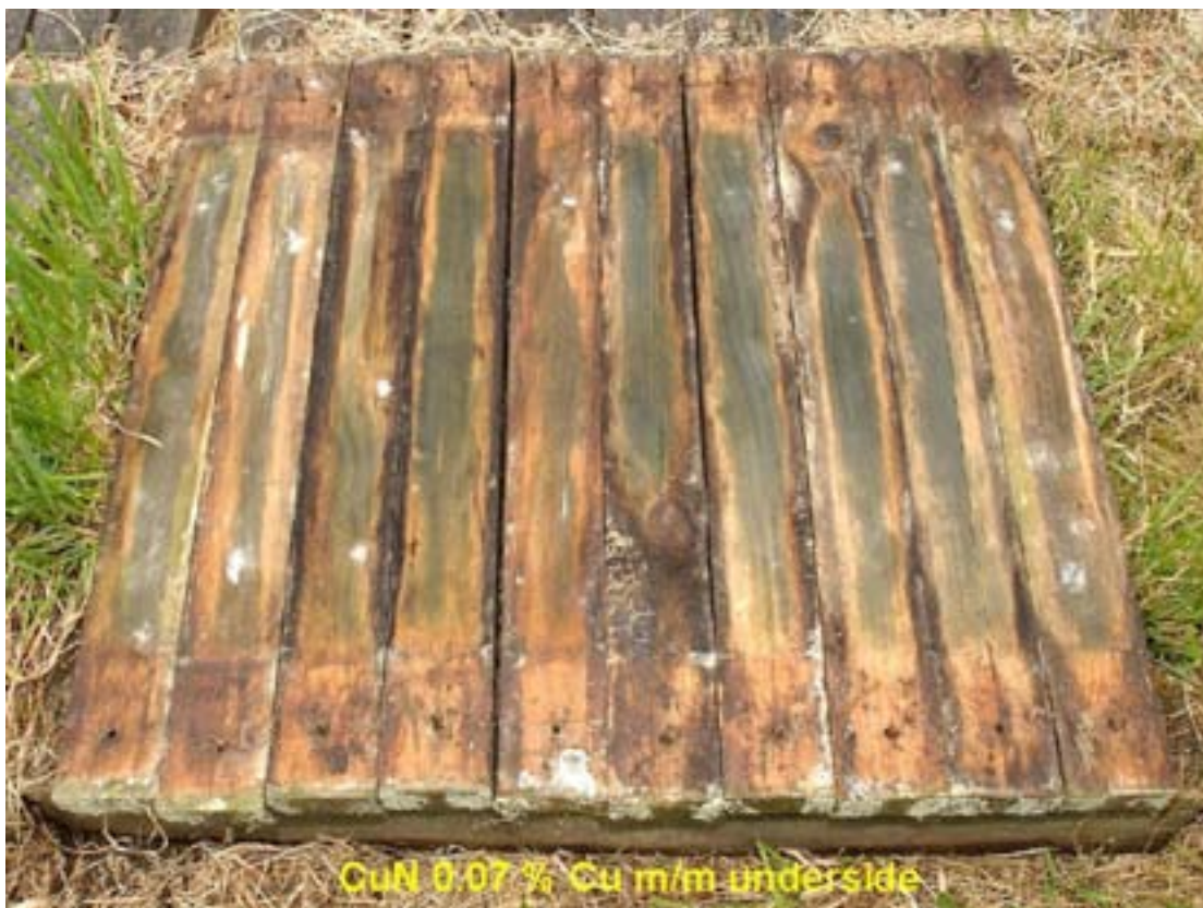
Figure 4. Copper naphthenate-treated P. radiata decking with 0.07% m/m copper after 13 years, underside.