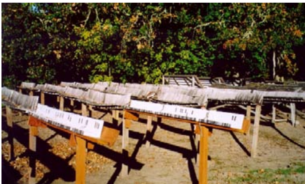
Figure 1. Example of L-joint tests.

The paper describes long-term L-joint field trials in the UK of treated and painted P. sylvestris . The oldest trial was installed in 1982 and showed that double vacuum treatments with 1% TBTO and 5% PCP gave similar performance. These preservatives lacked water repellent additives. Half of the L-joints protected with either treatment had failed after twelve years. Another L-joint trial installed in 1985 of painted P. sylvestris examined formulations that included water repellents. Half of the replicates treated with 1.8% TBTN had failed after 14 years, whereas the majority of replicates treated with 1% TBTO (tin equivalent in TBTN) were still serviceable after 16 years.